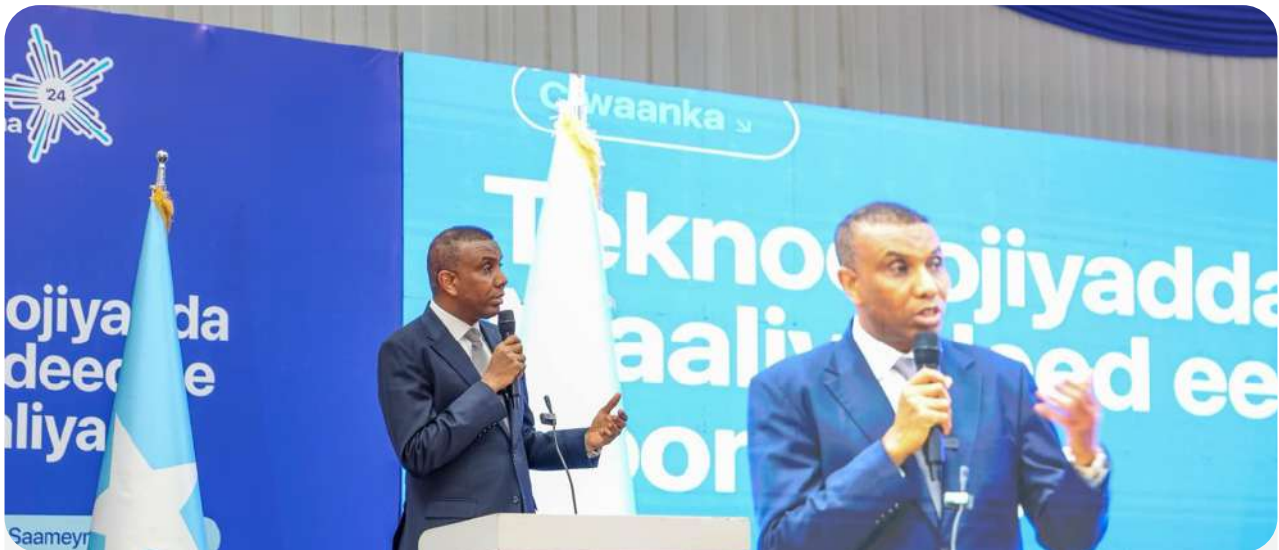
HE Hamze Abdi Barre, the Prime of Somalia, officially closed the Forum.

Prime Minister Hamza Abdi Barre's speech was marked with national pride at the growth, and progress unlocked through the adoption of technology into Somalia's economy and governance. He acknowledged the private sector's pivotal role in this transformation, celebrating their efforts as cornerstone of the Somali fintech landscape which is transforming daily life, empowering citizens, and supporting governance in Somalia.