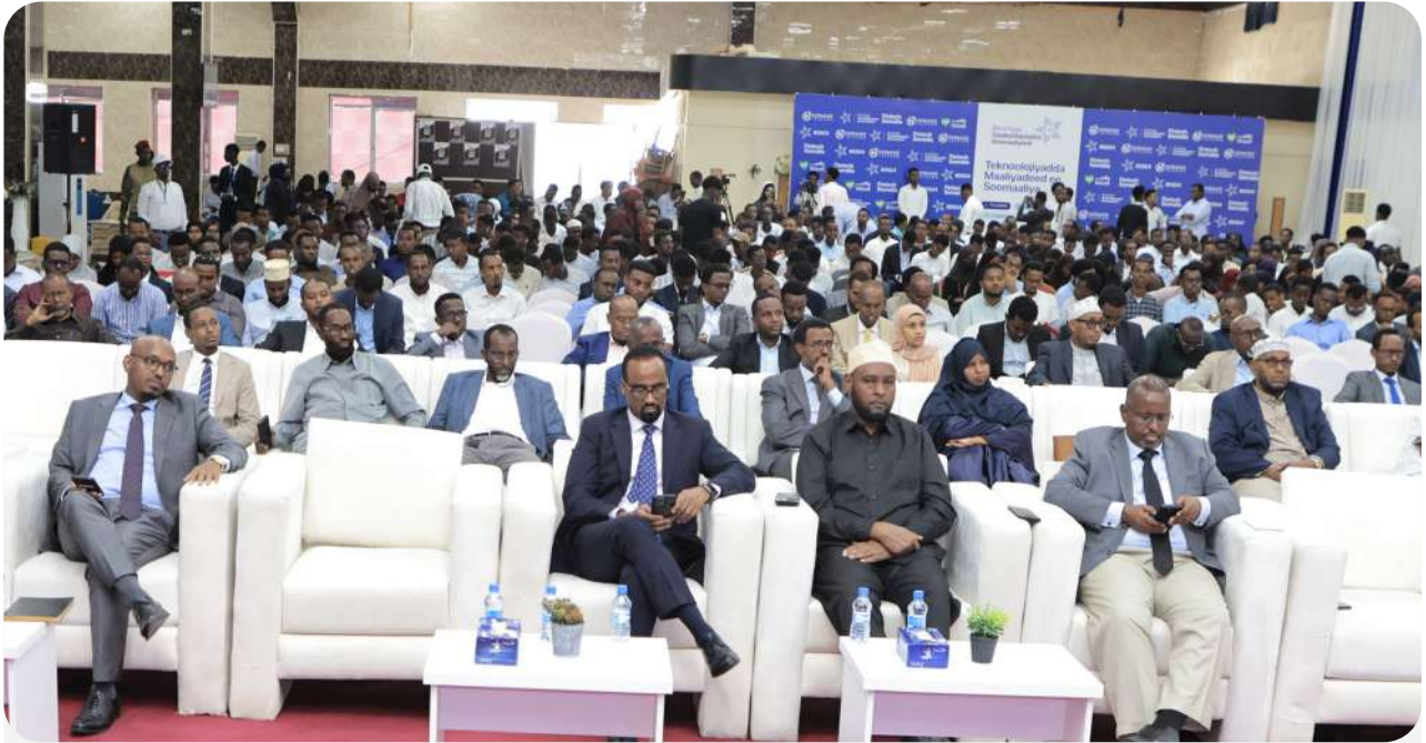
A panel discussion examining the legal challenges facing financial technology in Somalia

The panel discussions centred on challenges and opportunities within Somalia's burgeoning fintech sector. Various business leaders, field experts and government officials participated.