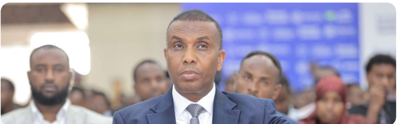
HE Prime Minister Hamza Abdi reaffirms the government's commitment to secure digital governance, with plans to introduce regulations on data protection, cybersecurity, and digital payments, alongside expanding the digital ID program.

Bandhigga Guulaystayaasha Soomaaliyeed (BGS) is an annual forum for discussion of Somalia's business challenges and aspirations organized by Hormuud Telecom, Somalia's premier telecommunications company. The forum brings together leaders from business, government, academia, and development actors to explore avenues for enhancing Somalia's private sector development and identify options for collaboration, innovation, and growth in the economic sectors that hold immense promise for the country.